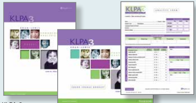
KLPA-3 English edition