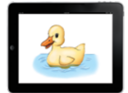
Client's iPad view