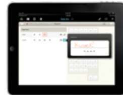
Clinician's iPad view