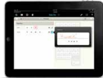
Clinician's iPad® view on Q-interactive®