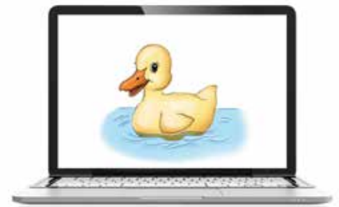
Client's laptop view

Flexible • Comprehensive • Efficient • Portable