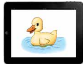
Client's iPad view on Q-interactive

Visit Pearsonclinical.co.uk/GFTA3KLPA3 for more information