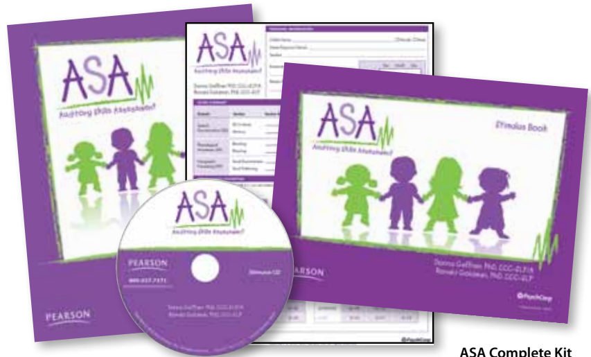
ASA Complete Kit